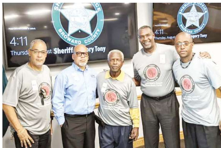
Members of the PPP (People, Pastors, Police) at the real-time command center.