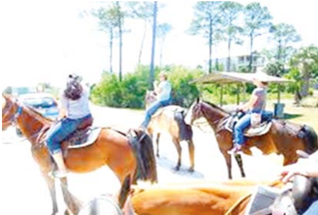
Trip Advisor - Sand and Spurs Equestrian Park