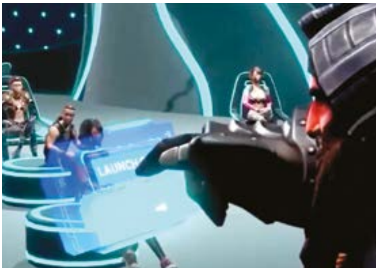
Image Depicting Virtual Learning from Inside the Metaverse