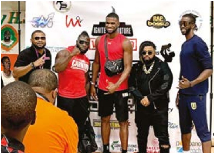
Ignite the Culture Celebrity Charity Basketball Game in Full Swing