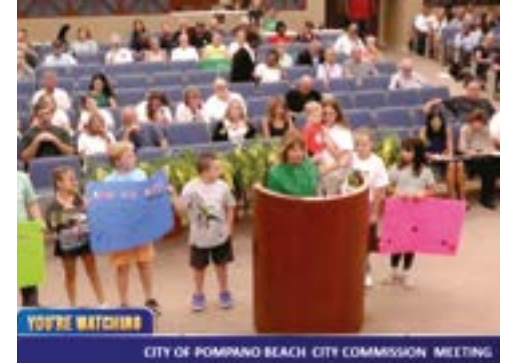
Screenshot of July 25, 2023 Pompano Beach City Commission Meeting