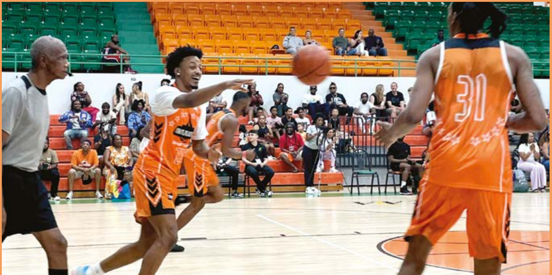
Ignite the Culture Celebrity Basketball Game