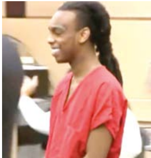
Jamell Demons, aka YNW Melly, appeared in Broward County Court on Friday, August 4 for brief hearing regarding jury selection for retrial. Jury selection is scheduled for October 9th, pushed back one week from October 2nd