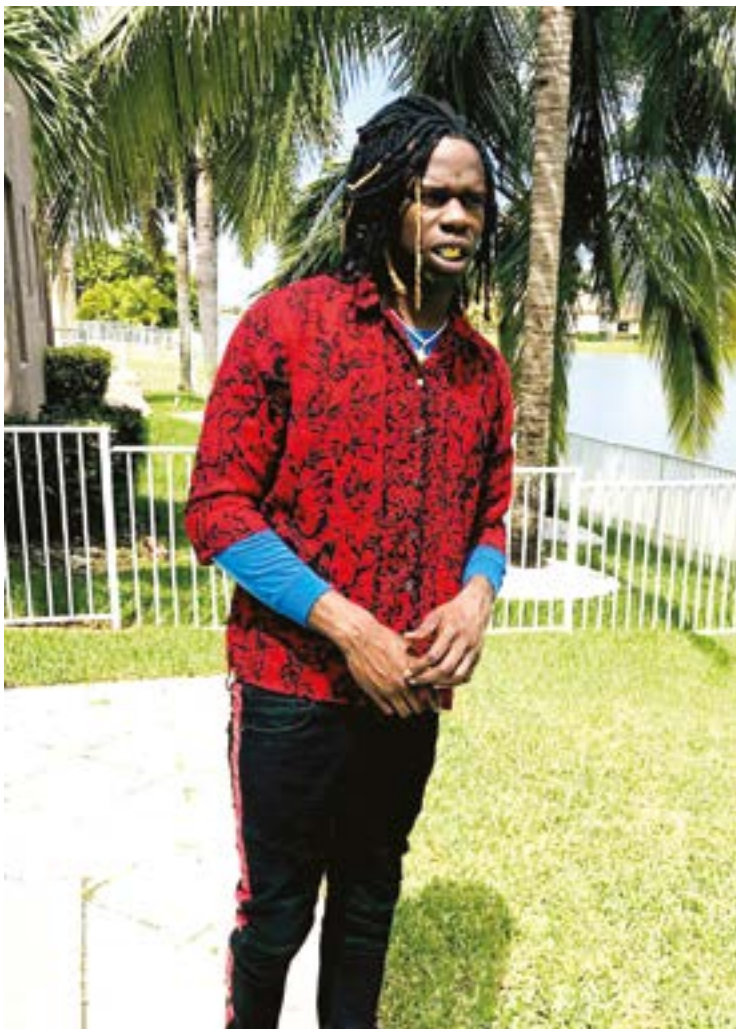
Anthony Williams (YNW Sakchaser)